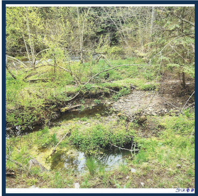
Before bank stabilization.