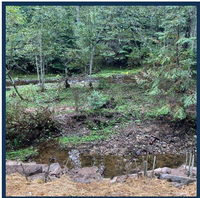
After bank stabilization.